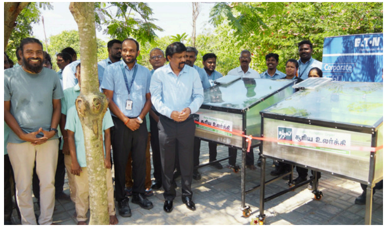
Fig 2. Solar Dryer