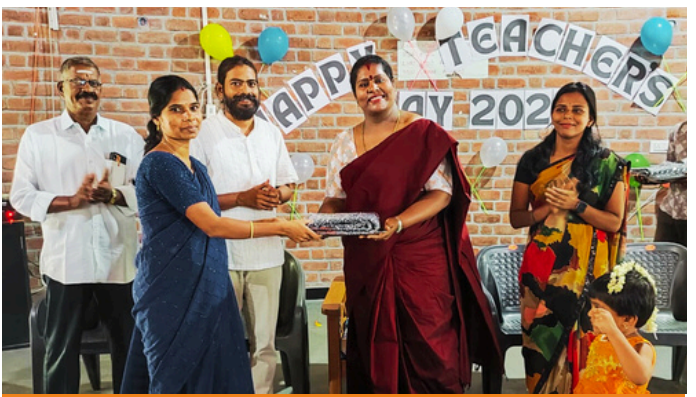
Teachers Day Celebration