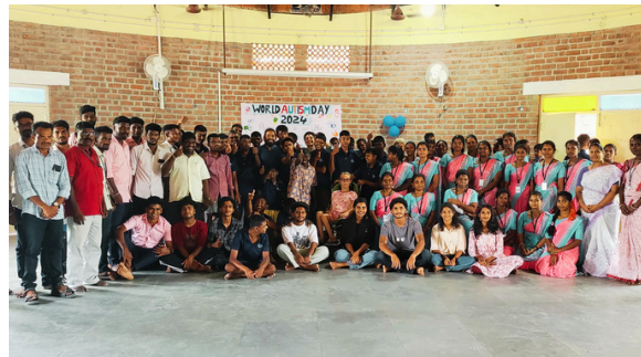
World Autism Day Celebration