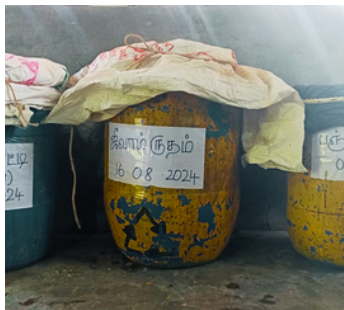
Natural Manure Preparation