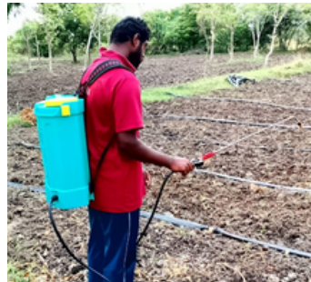
Spraying Natural Manure