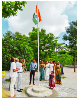
Independence Day Celebration