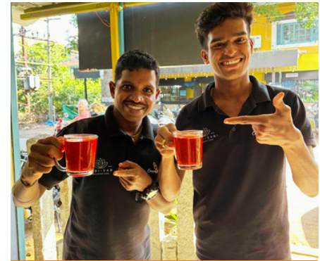
Herbal Tea Prepared at Wabi -Sabi

It also serves as a valuable internship space where our trainees are exposed to real-world work environments, helping them build confidence, communication skills and practical experience.