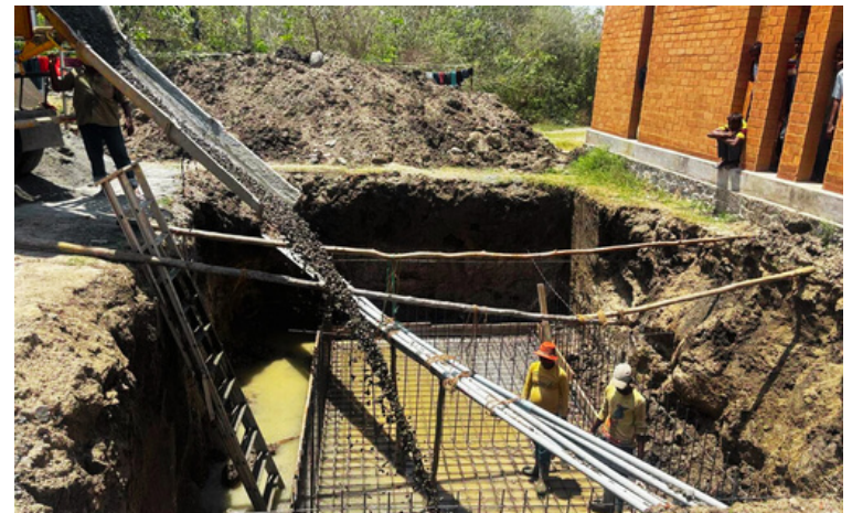
Fig 4. Rainwater Harvesting Tank Under Construction