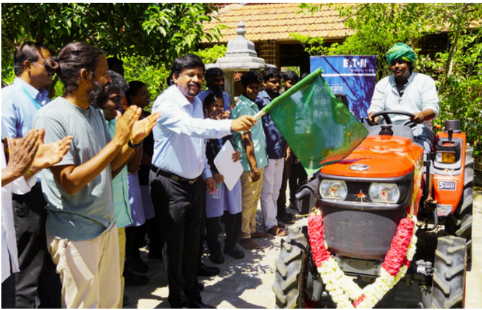
Fig 1. Flagging of Tractor