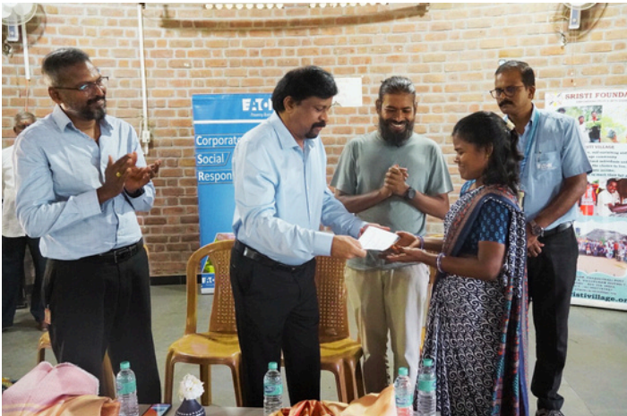
Fig 3. Vidya Vikas Scholarship