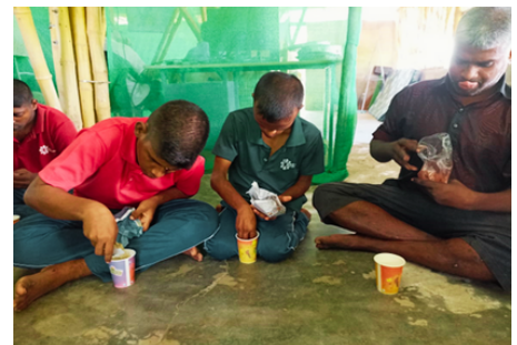
Seeds Identification Training