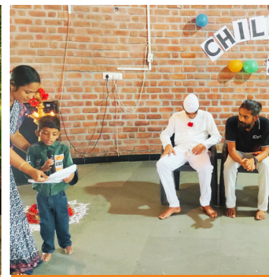
Childrens Day Celebration