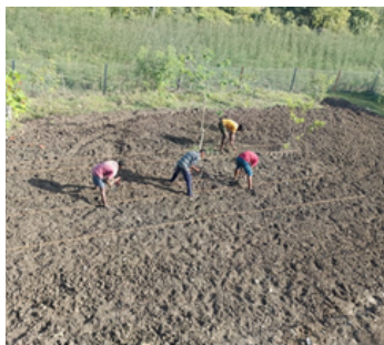
Soil Preparation & Raising Beds

Our trainees with intellectual and developmental disabilities have been actively involved in every stage—soil preparation, seed selection, sapling planting and organic fertilizer application using Jeevamirtham and Panchakavya. They are gaining valuable hands-on experience in real farm conditions supported by our trainers.