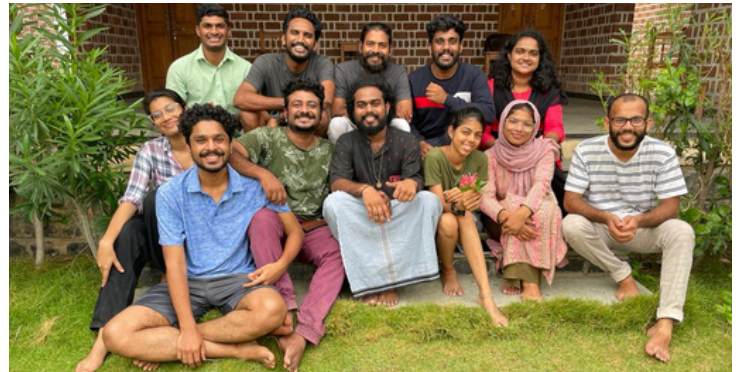
This time KHOJI India's Great Indian Treasure Hunt program held in our community space