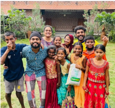
Child Development Centre from Pondicherry organized to spend a day for children from slum areas at Srستی