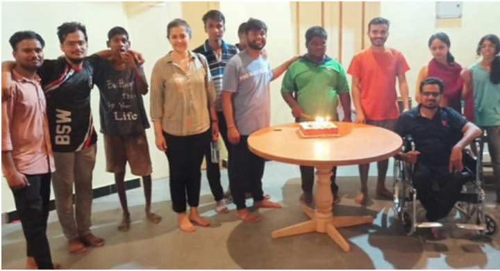
Public Policy & Governance Students from Azim Premji University visited Srستی for a Week Exposure Visit