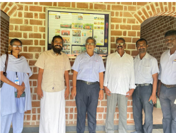
Worth Trust, a unique 60-year-old self-sustaining social organization, visited to study and encourage srستی model