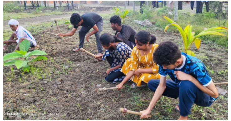
Social Work Students from Kodaikanal Christian College visited Srستی for Rural Camp as part of their studies