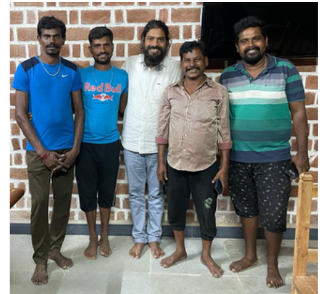
Katrathu Kaialahvu, Food-bloggers a popular food channel published our activities in their channel (Click Photo)