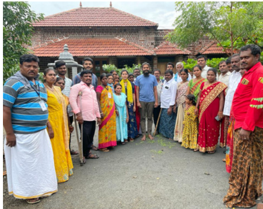
The Timbaktu Collective visited srستی to gain an in-depth insight into our methodologies and work