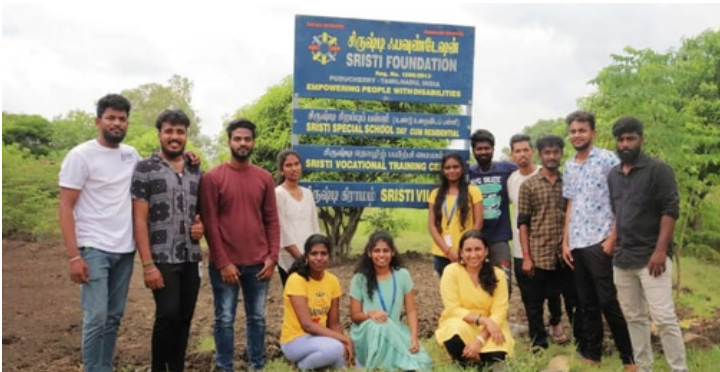
Agilisium brought their CSR freshers team to gain insight into the importance of social responsibility