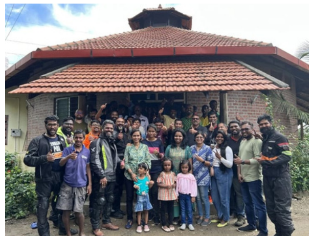
Chennai Royal Riders, Riding for a Cause visited srستی